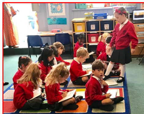
Talking of great attitudes, just look at Year 1 on Day 2 — this was taken at 8:52 am and they're already busy at work! Impressive!

There's lots to catch up on in this week's newsletter so I hope you find it useful.